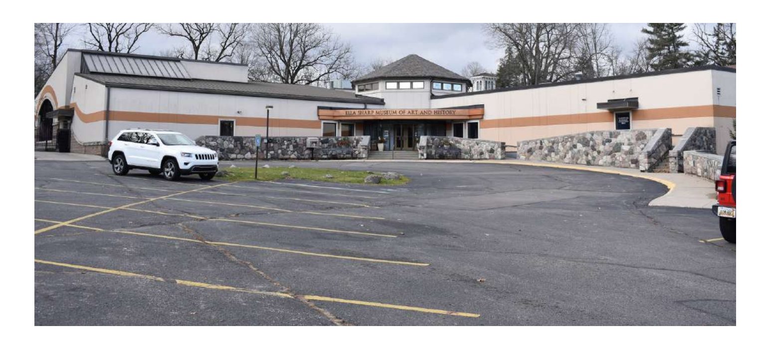
Then, we will park our car in the parking lot in front of the museum and walk to the entrance.