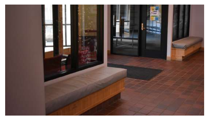
Inside, I see more benches where I can take a break. Since these are inside, I will need to use my quiet voice when resting here.