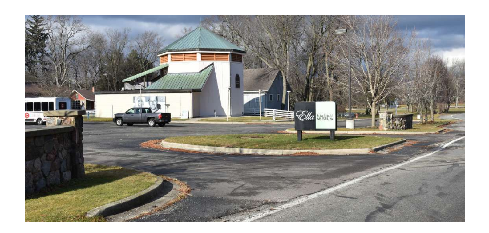
To get to the Museum, we will drive through the Ella Sharp Park until we get to the Ella Sharp Museum sign.