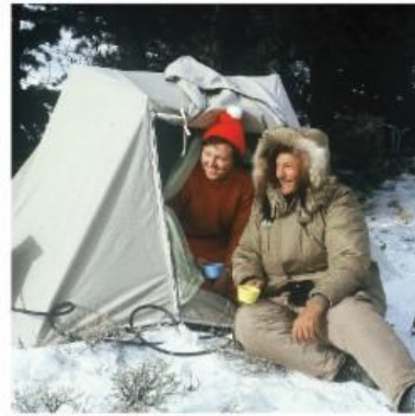
THE LIVING WILDERNESS January 11–June 30