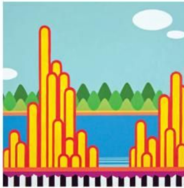
SIDE QUESTS: PAINTINGS BY TIMOTHY GAEWSKY March 16–July 7