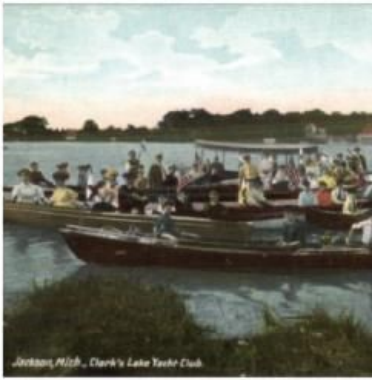
THIRD COAST CONSERVATIONS March 22–July 7