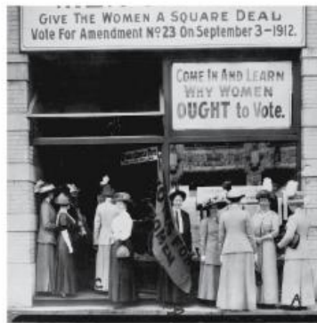
PETTICOAT PATRIOTS December 21, 2018-March 3, 2019