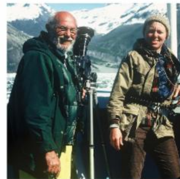
THE LIVING WILDERNESS January 11-June 30, 2019