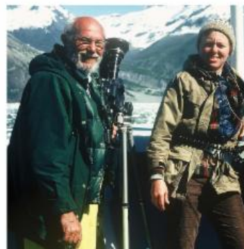
THE LIVING WILDERNESS January 11-June 30, 2019