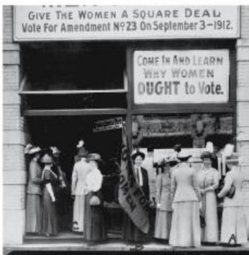
PETTICOAT PATRIOTS December 21, 2018-March 3, 2019